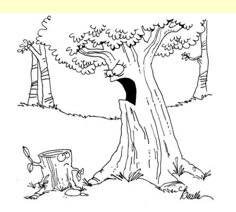
"I don't care if all the kids are wearing it that way. You'd better grow it back before your father gets home."

From February 13 to 19, you have an entire week to become something of a hero. A person overloaded with packages will be surprised and pleased when you offer to carry one. The co-worker who drops papers on the floor will admire your kindness when you help to pick them up.